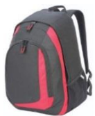
Geneva Backpack £15.99

Add any of these items to your uniform order and pay weekly, monthly, 'as and when' or in full when you collect!