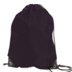
PE Bag (various) £2.99