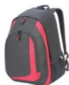
Geneva Backpack £13.99

Add any of these items to your uniform order and pay weekly, monthly or in full when you collect!