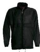
Rain Jacket £11.99 - £13.99