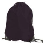
PE Bag (various) £2.99